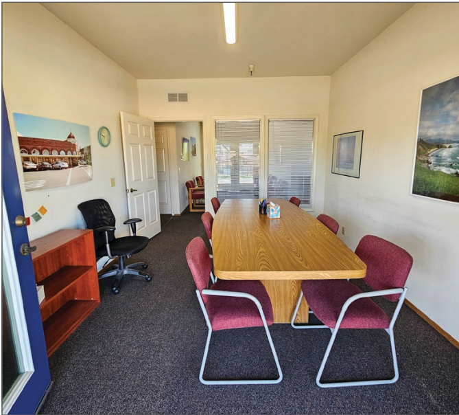
Common Area Conference