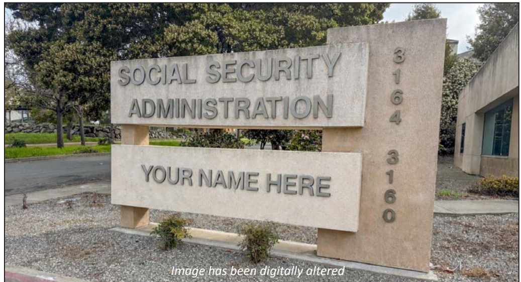
Image has been digitally altered