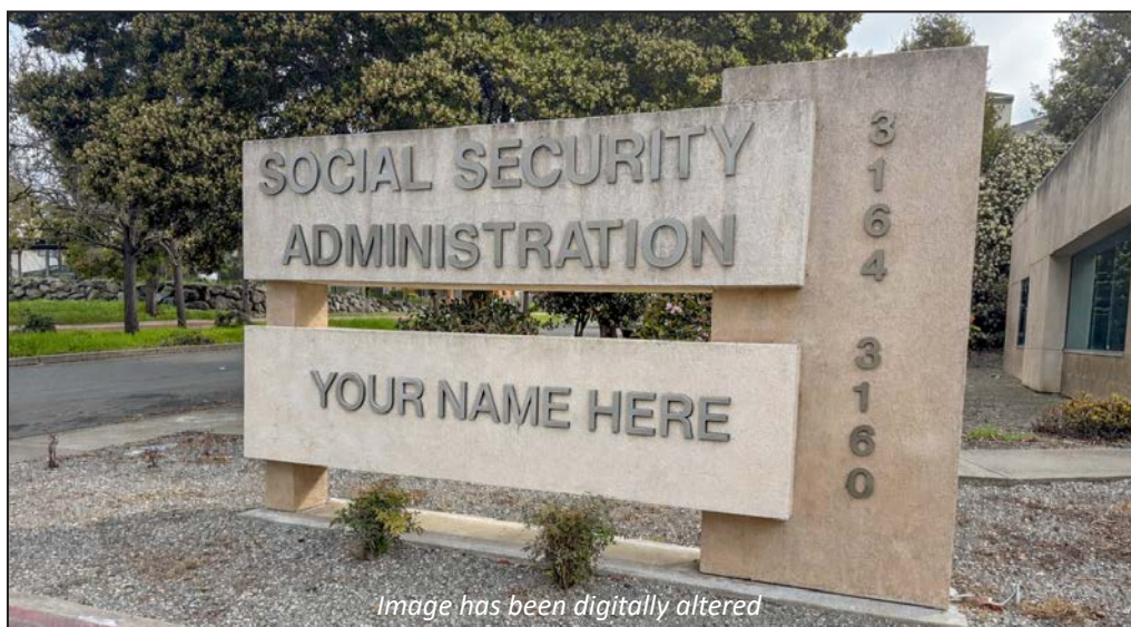
Image has been digitally altered