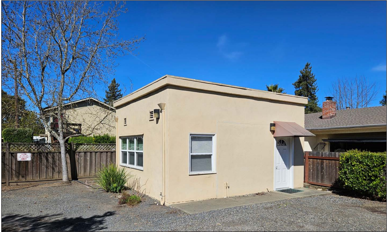
825 College Ave., Suite 12 - Actual Building for rent

825 College Avenue, Suite 12, Santa Rosa CA 95404