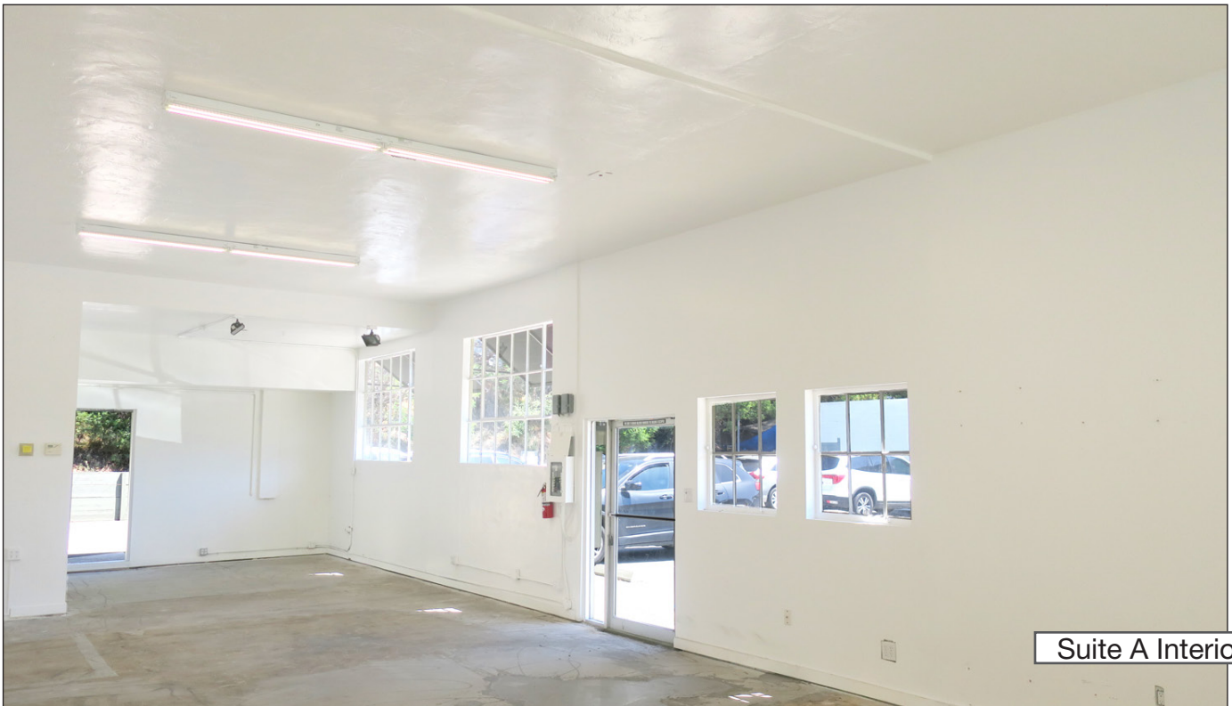
Suite A Interior