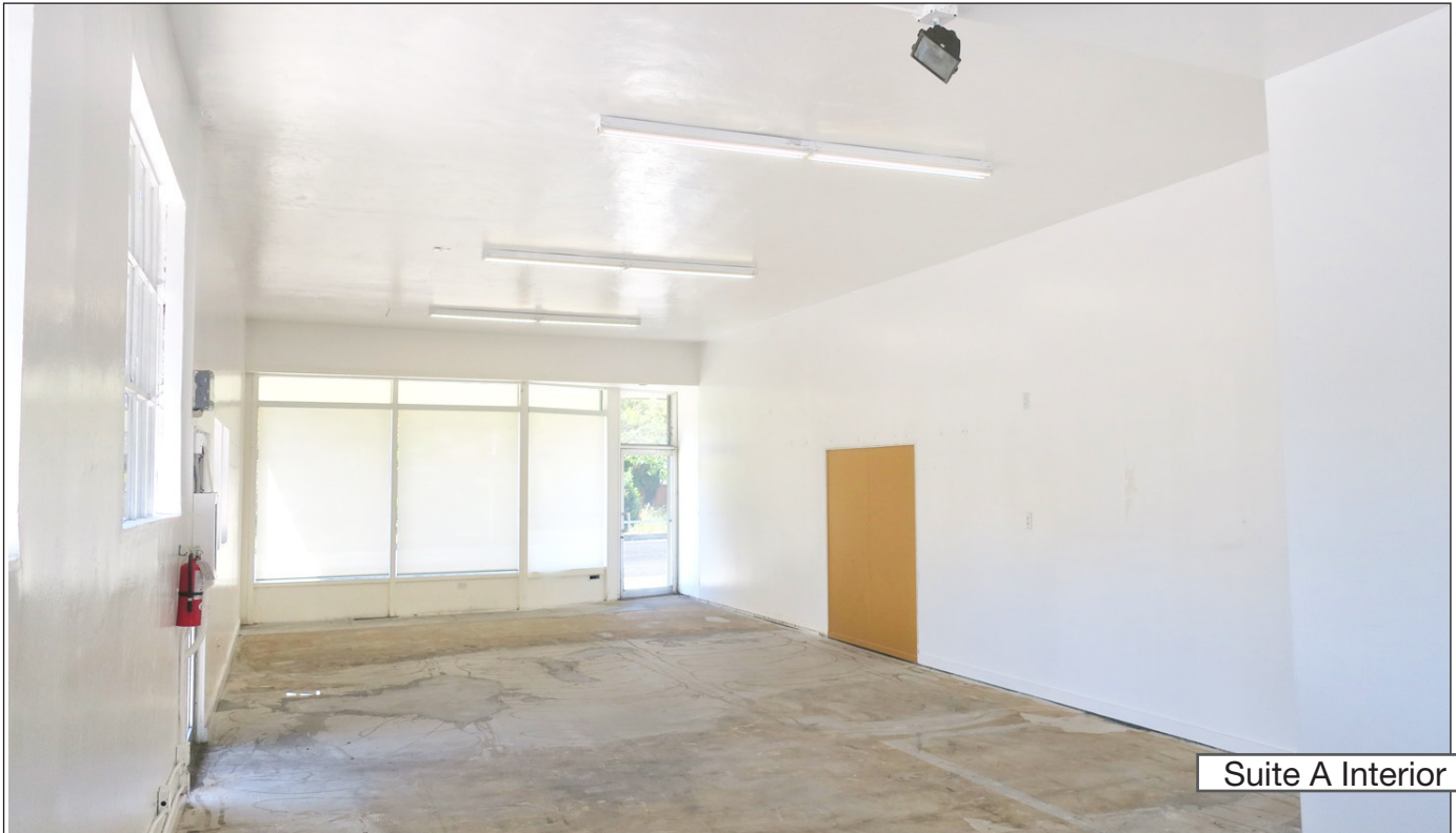
Suite A Interior

2240 4th St., Ste. A, San Rafael, CA 94901