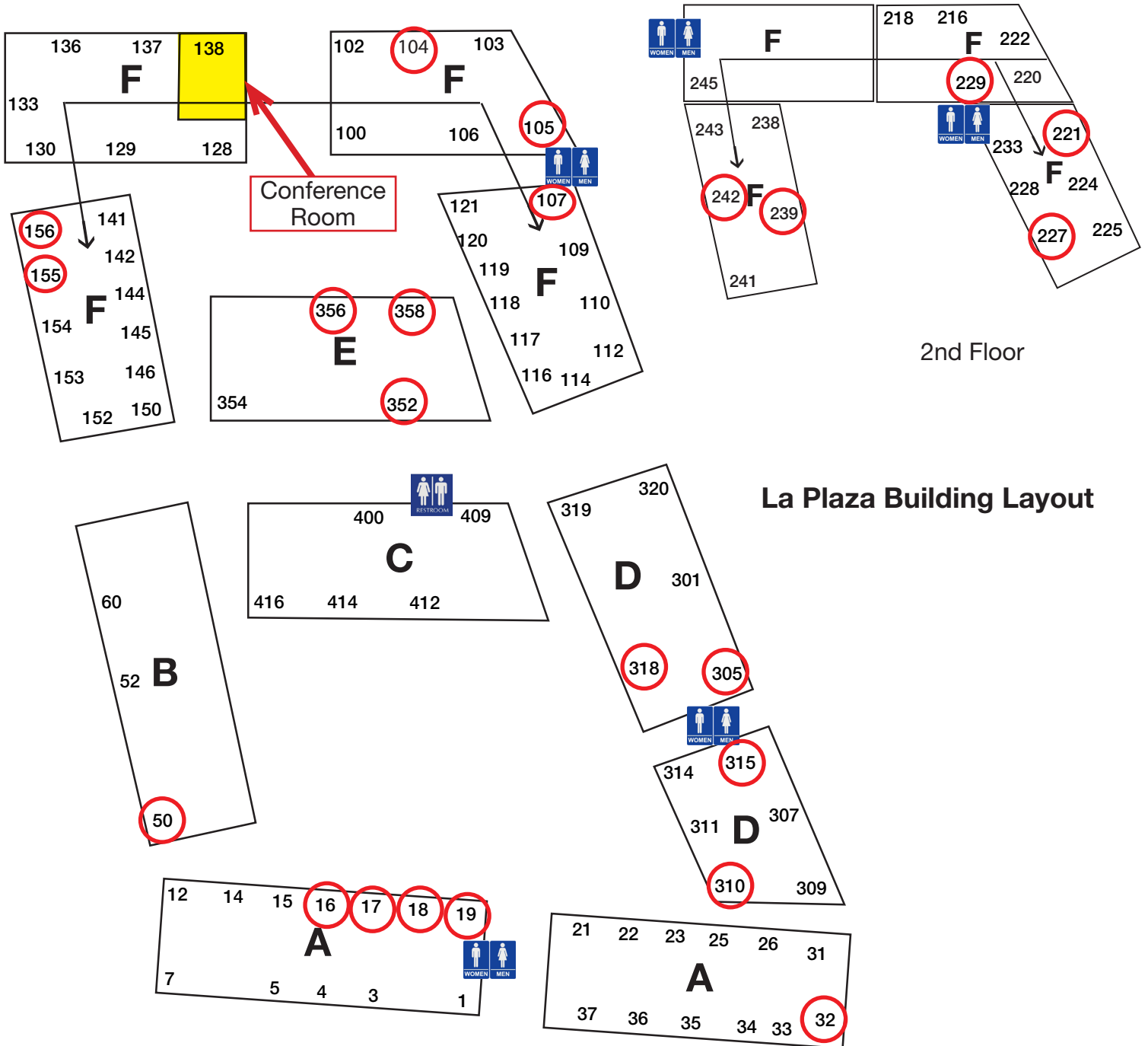
La Plaza Building Layout

4340 Redwood Highway (La Plaza), San Rafael, CA 94903