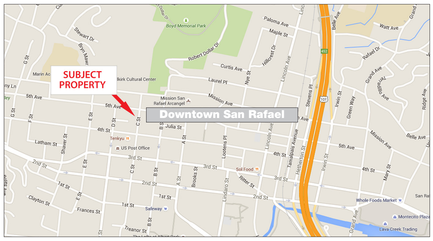
Click here to View in Google Maps